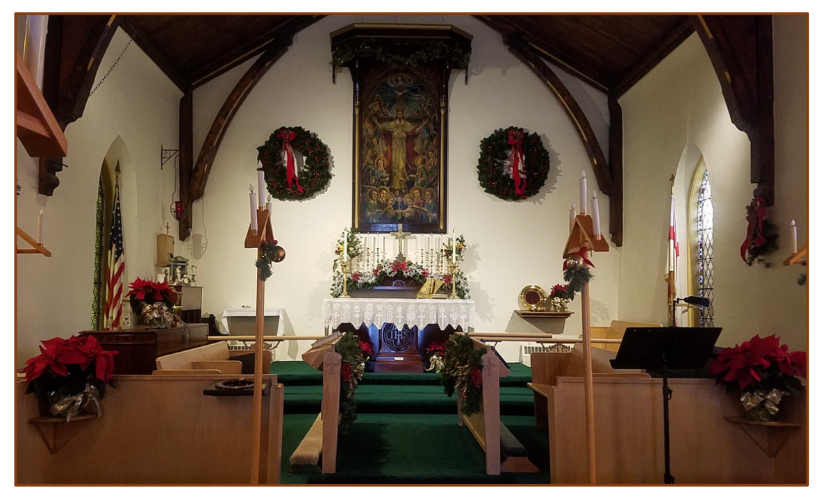
Sanctuary, Episcopal Church of the Good Samaritan, Gunnison CO