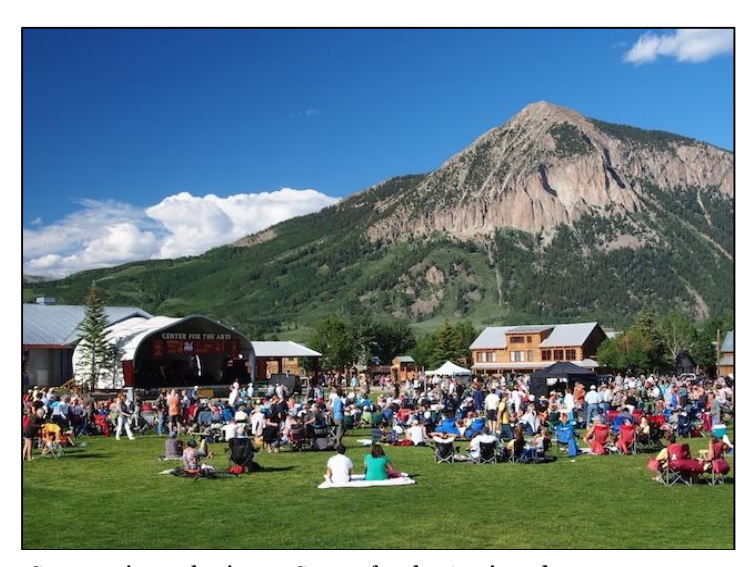
Community gathering at Center for the Arts' outdoor stage, Crested Butte

Worship -Rite 2 with occasional live music or recorded sacred music. All Saints uses traditional hymns with a keyboard during summer and winter months and no music the rest of the year. However, since Advent of 2020, we have incorporated recorded sacred music at our Evening Prayer and Compline services. We hope to offer a weekday-evening gathering and are exploring an Evensong service featuring local jazz musicians.